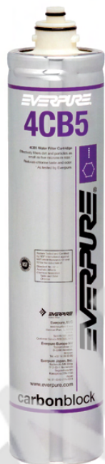
4CB5 Replacement Cartridge: EV9617-11

Delivers quality water for foodservice, vending and OCS applications